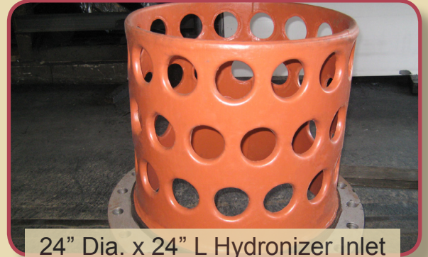
24" Dia. x 24" L Hydronizer Inlet