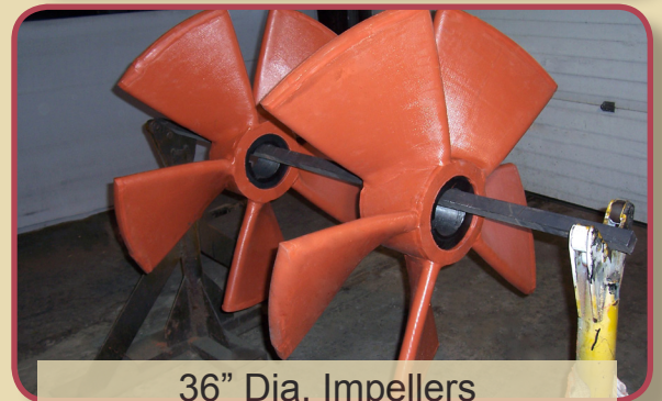
36" Dia. Impellers