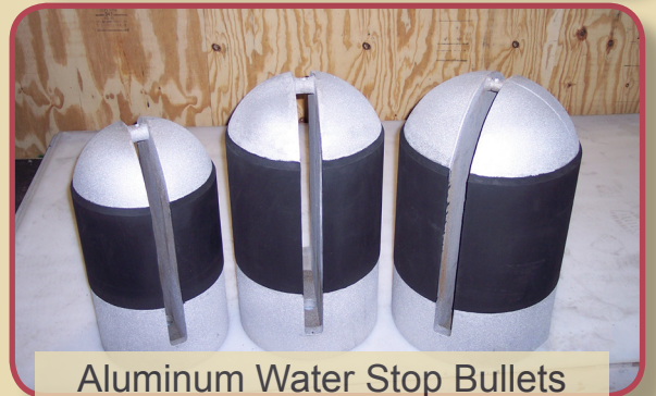
Aluminum Water Stop Bullets