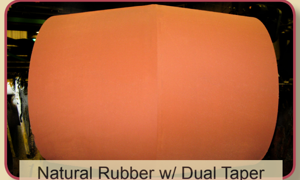
Natural Rubber w/ Dual Taper

A variety of rubber compounds are available to meet your specific service requirements. Even multi-layer applications are available, such as cushioning soft under-layer with harder rubber on outside surface.