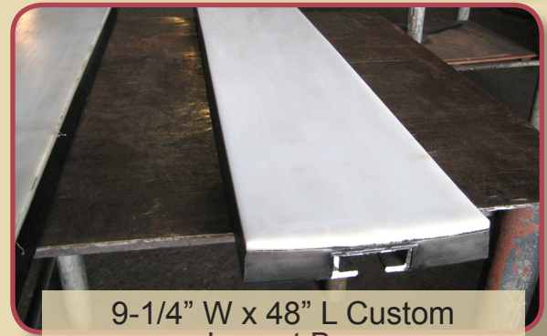
9-1/4" W x 48" L Custom Impact Bar