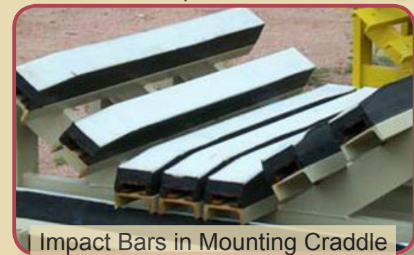
Impact Bars in Mounting Cradle

Sioux Rubber & Urethane is an ISO 9001 certified custom operation, providing application and manufacturing services in large and small quantities for all types of customers ranging from OEM's to small town repair shops.