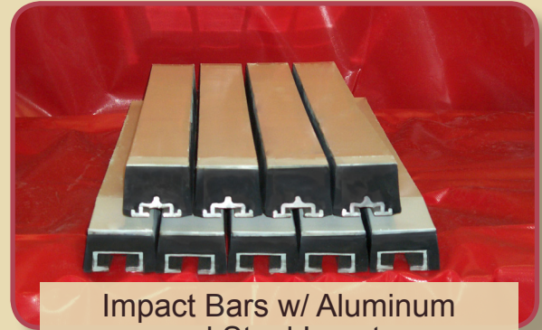
Impact Bars w/ Aluminum and Steel Inserts

2620 Hawkeye Drive Sioux City, Iowa 51105 Fax: 712-252-3258 www.siouxrubber.com