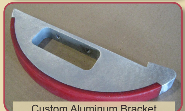
Custom Aluminum Bracket

Contact Sioux Rubber & Urethane if you have any questions or would like a price quote.