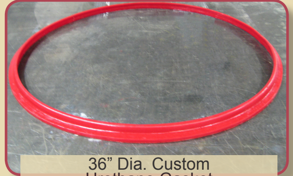
36" Dia. Custom Urethane Gasket