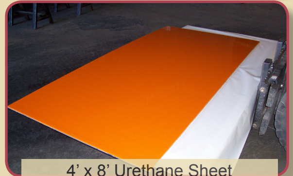
4' x 8' Urethane Sheet