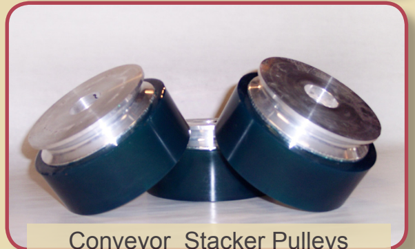
Conveyor Stacker Pulleys