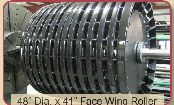
48" Dia. x 41" Face Wing Roller