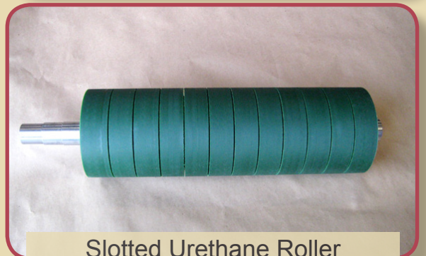
Slotted Urethane Roller

Contact Sioux Rubber & Urethane if you have any questions or would like a price quote.